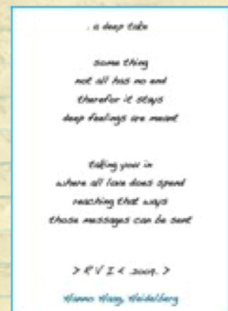
Sample Back Side

Calendar Future will be printed on archival paper durable over 1111 years; in total it will be 151 feet thick and weigh 2,4 tons in the DIN A 4 format. A printing machine needs to run for 30 days, and sorting the sheets one must be very focused.