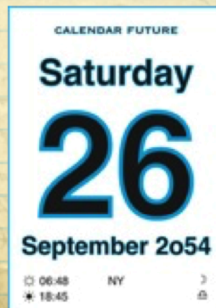
Sample Front Side